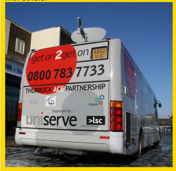
For more information see The Mobile Learning Bus case study in the Take Part resources at www.takepart.org

Over 400 learners used the bus. For communities, the learning had a knock-on effect. As the learners developed new skills and confidence, they improved their relationships with others.